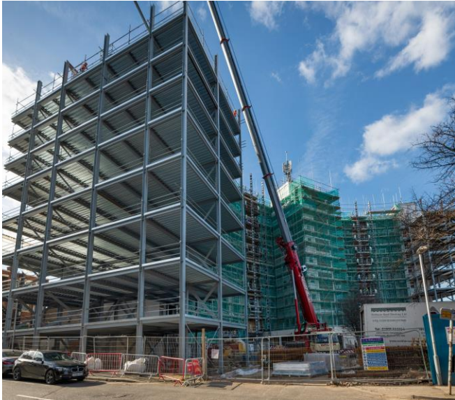
Rear elevation from Pavilion Road – South Tower New Build.

We are constructing 121 apartments, which will be a mix of 1-bedroom, 2-bedroom and 3-bedroom duplex penthouse apartments and will be developed over 11 storeys.