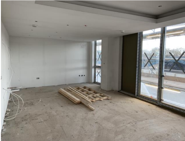
Two-bedroom apartment on the 1 st Floor.

Images taken at the Marketing Suite shown below: