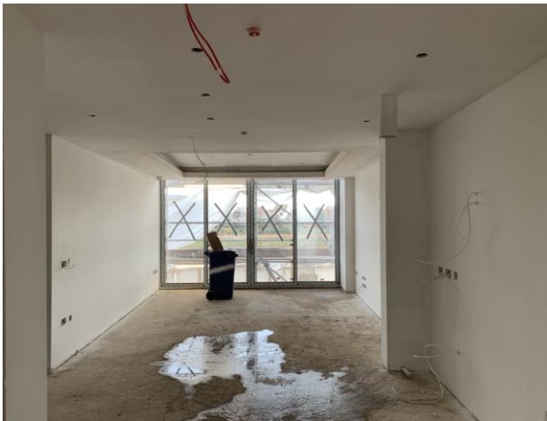
One-bedroom apartment above the 4 th Floor.