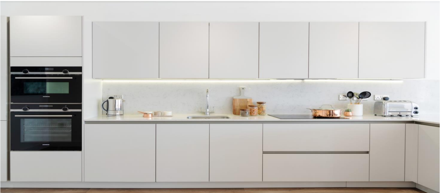
Example Pronorm Kitchen available to see at the Marketing Suite with the light grey kitchen door finish and silestone worktop. Please note that this is representative of a 2-bed apartment.